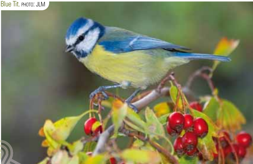
Blue Tit.

The river, present virtually along the whole stage, allows for the presence of large birds such as Grey Heron and even Great Cormorant in winter, on top of the already named typical riparian species of birds.