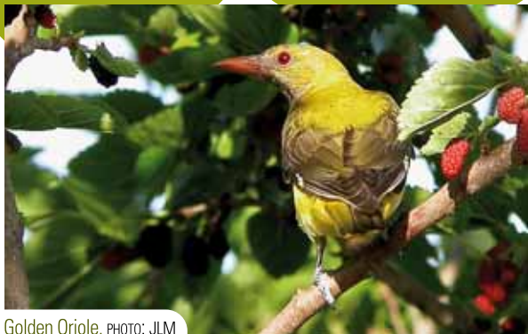
Golden Oriole.

At the starting point you can see urban dwellers, such as Eurasian Collared Dove,