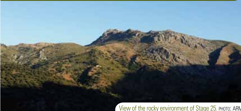
View of the rocky environment of Stage 25.

Spotted Flycatcher, Woodchat Shrike, Great Tit, Goldfinch, Serin, Greenfinch and Cirl Bunting. These birds, together with rock-dwelling species such as Alpine Swift, Crag Martin and Blue Rock Thrush, create one of the most diverse birdlife starting points of all the stages along the Great Malaga Path.