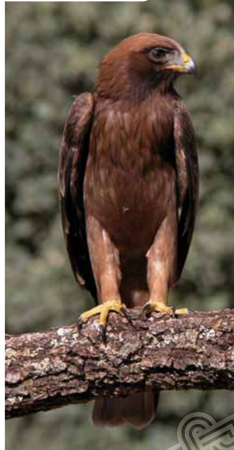
Booted Eagle, dark morph.

together with the short length and the beauty of its landscape makes Stage 25 especially attractive. In Natural Values section of Stage 24 you can find information about Cueva del Gato, a cave located very close to the starting point of Stage 25. Moreover, it is recommended to read the Did you know? section of Stage 34, where you can find information about swifts. ○