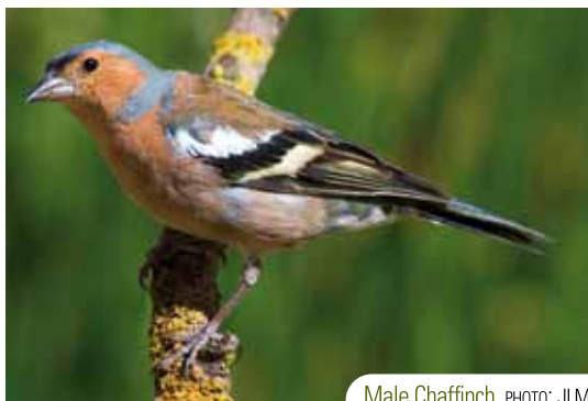
Male Chaffinch.

identifying Swallows, as in spring and summer it is possible to find up to 4 species at the same time (Barn Swallow, Red-rumped Swallow, Crag and House Martin) Additionally to the previously mentioned species of birds, the type of vegetation encourages the presence of Blackcap and Black-eared Wheatear. It is worth mentioning the presence of olive trees with very thick trunks before you arrive at Periana where amongst the Great Tits and Chaffinches you may be able to spot the rare Rufous-tailed Scrub Robin, however it is a bird which is difficult to see.