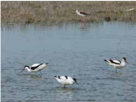
Avocets and Black-winged Stilt at Vicario path near Visitor’s Centre.

The Rufous-tailed Scrub Robin owes its name in Spanish, Alzacola , (“ alzar ” meaning “to raise” and “ cola ” being the word for “tail”) to the habit of cocking its tail up as it perches, which makes the bird quite noticeable (the tail is reddish brown with a black and white band at the tip). In the vicinity of the lake you can see various species of waterfowl flying back and forth from the seasonally flooded areas. Greater Flamingo, Black-winged Stilt, gulls and ducks make up, in most cases, the major part of such flocks.