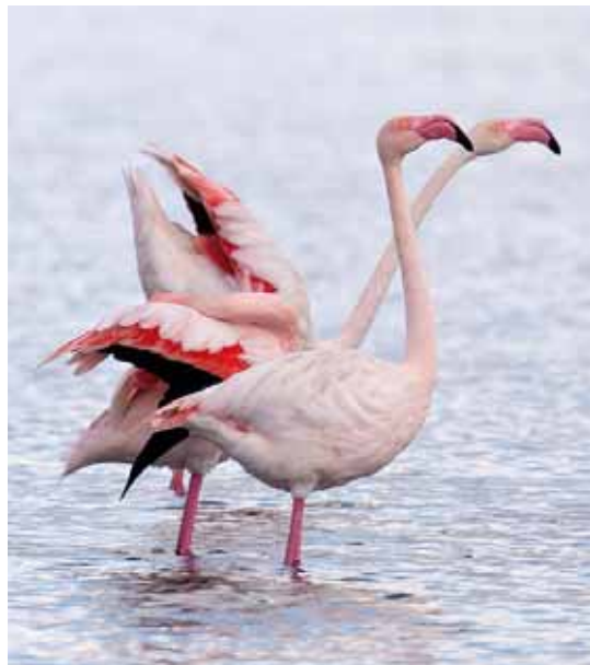
Greater Flamingoes.