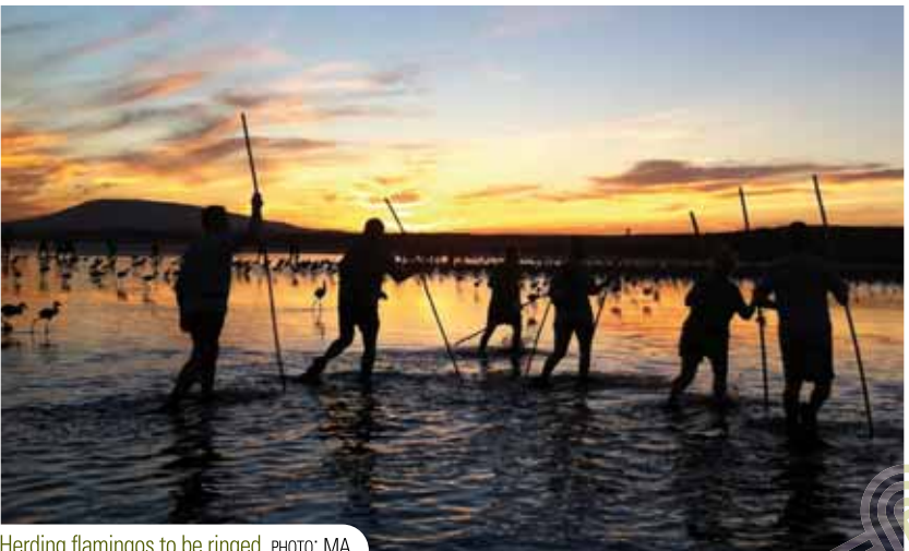
Herding flamingos to be ringed.

Azure-winged Magpie, Spotless and Common Starling, Goldfinch, Greenfinch, Common Linnet, Serin and Corn Bunting. As you walk uphill and enter the forest mass in the sierra, the Azure-winged Magpie becomes more abundant, as