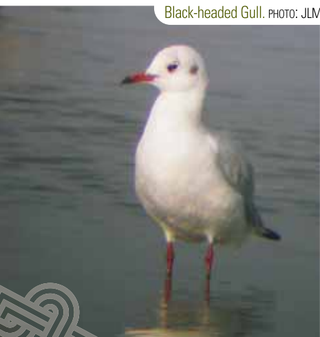
Black-headed Gull.

Tit, Short-toed Treecreeper, Wren and Eurasian Jay. Other birds which occur in the holm oak copses and, mainly, in the pine woods, are Red-necked Nightjar, Stonechat, Black Redstart, Common Chiffchaff, Southern Grey Shrike, Raven and Cirl Bunting. Rufous-tailed Scrub Robin deserves a special mention at Stage 17, a migrating species which spends its winter south of the Sahara desert. In Spain it exclusively occupies the south of the peninsula in an intermittent manner; for the last two decades it has shown an apparent decline both in its distribution area and its population levels. At the moment the causes of the bird's progressive decline are unknown. Its nesting grounds at Stage 17 are located close to the mountainous section in olive groves, vineyards and the stretches of natural vegetation where wild olive is the predominant plant.