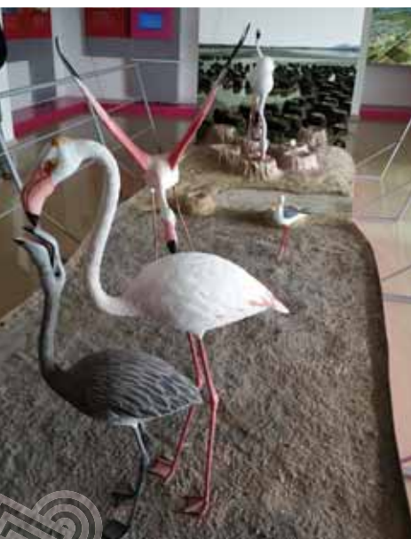
Inside the centre.

The environment composed of farmland, mainly cereal crops and olive groves with almond trees in some sections, supports the species mentioned in two previous stages. The main species are Common