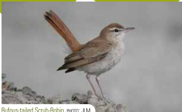
Rufous-tailed Scrub-Robin.

The initial stretch of this stage of the walk takes you along the road surrounded