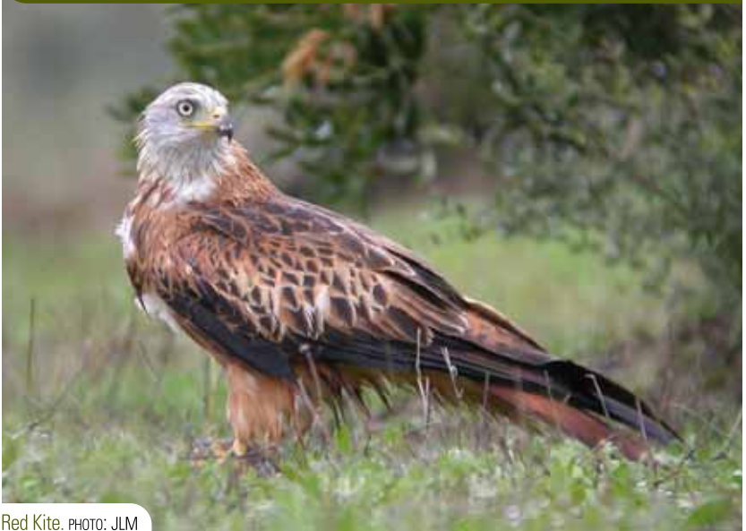
Red Kite.

Buzzard, Common Kestrel, Red-legged Partridge, European Turtle Dove, Hoopoe, Barn Swallow, Meadow Pipit, White Wagtail, Crested Lark, Calandra Lark, Skylark, Song Thrush, Sardinian Warbler, Blackcap, Common Chiffchaff, Great Tit,