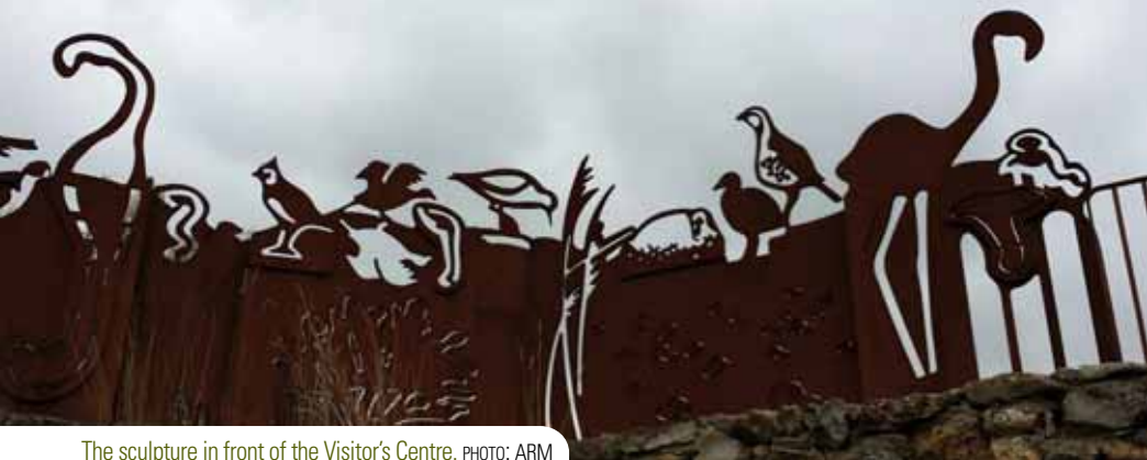
The sculpture in front of the Visitor's Centre.

past grain fields and olive groves. Once you are at Cerro del Palo, at the end of Stage 17, you will find a few pools where waterfowl are the star species; the pools maintain their water level thanks to the water originating from Fuente de Piedra.