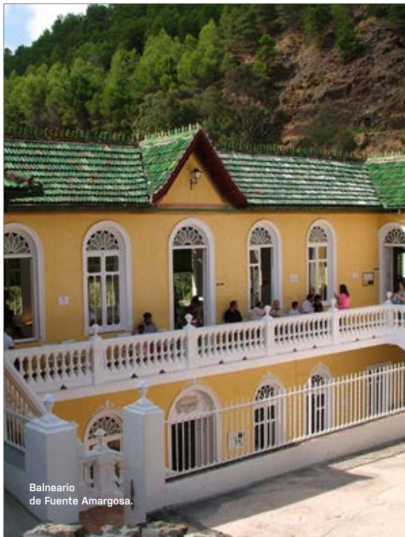
Balneario de Fuente Amargosa.

of Paraje Natural (Natural Reserve). Curiously, after the Siege of Málaga in 1487 by the Catholic Monarchs, the river was known by the name of Guadalquivirejo.