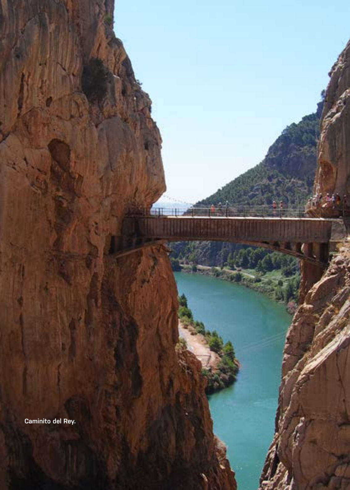
Caminito del Rey.