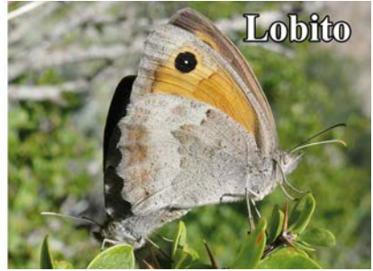
Dusky Meadow Brown