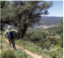
▲ Starting the journey